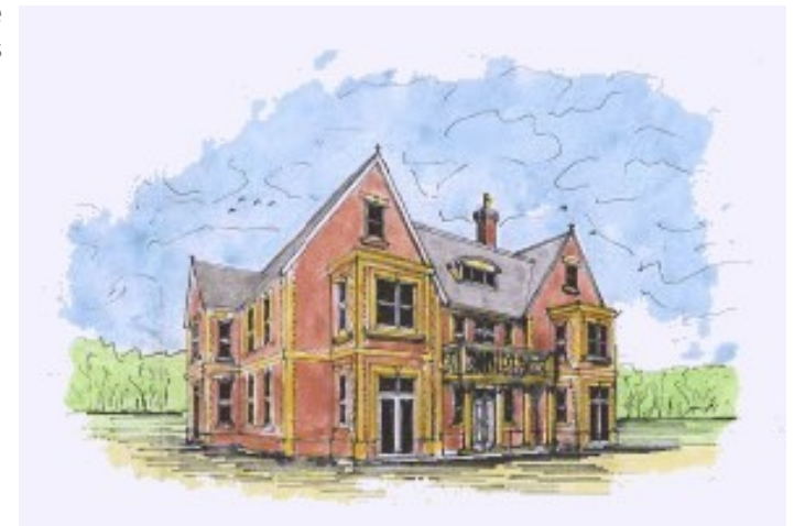
Artist's impression of currently approved dwelling

VIEWING Strictly by prior appointment through the selling agents' Norwich Office. Tel: 01603 629871